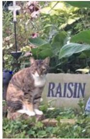
Sookie's Pawprints on Our Hearts

When we first moved to our first home in Dryden we got a little kitten from the Ithaca SPCA. We named our Tortie Tiger Cat, Sookie, and for almost 20 years that precious kitty filled our lives with memories. She started as an indoor cat that we let out on the second story deck. The plastic fencing was no match for her and she became an indoor outdoor cat. She used to go on walks with Raisin ducking into the woods to hide from the cars well before we knew that they were coming. Raisin was the only animal she ever tolerated.